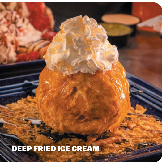
DEEP FRIED ICE CREAM