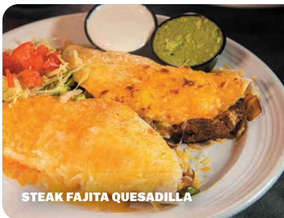
STEAK FAJITA QUESADILLA